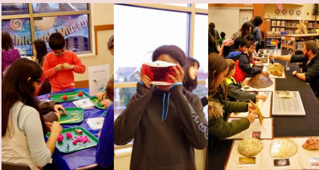
Fun exhibits at the 2018 Science Fair.